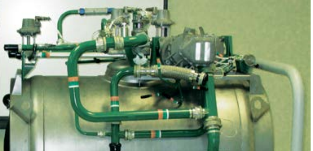
C-5 Fuel Systems Trainer Panel 2