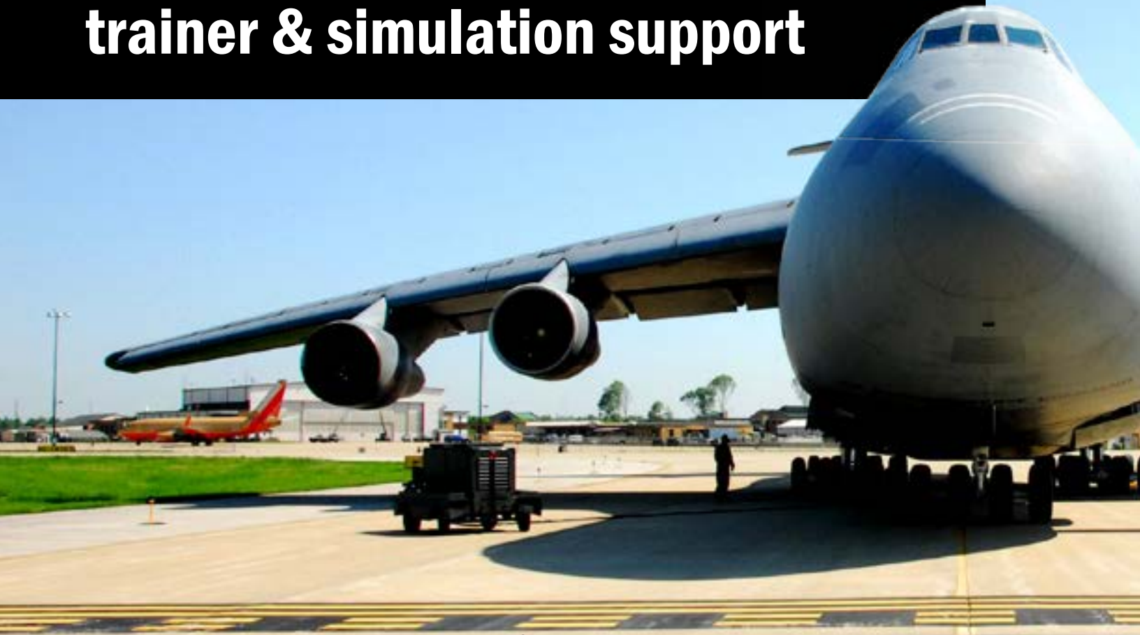
Use of government photos does not constitute or imply government endorsement.